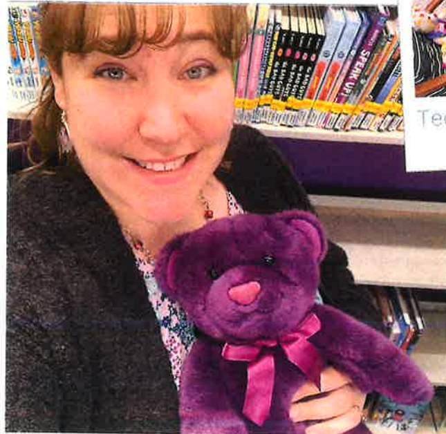
Me and my Teddy