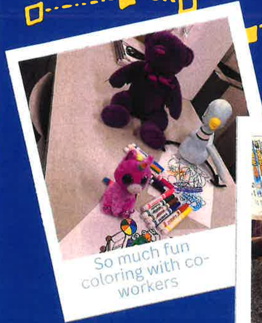
So much fun coloring with co-workers