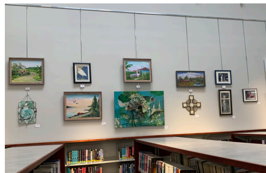
W.H.A.T. (We Have Artistic Talent) exhibit in the library's gallery August-mid-October 2023.