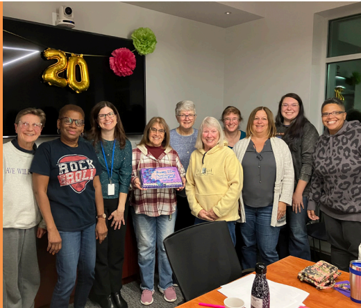
Members of the Evening Book Group celebrated the group's 20th anniversary on November 2, 2023.

A Memory Café is a social gathering with a focus on topics that are likely to inspire pleasant memories, laughter, and positive feelings for those who are experiencing early stage dementia, mild memory loss or cognitive impairment, AND a family member or care partner. It is a place to have fun, find support, and share experiences. The Memory Café is not suitable for people to attend alone if they have specific care needs. Registration is encouraged but not required.